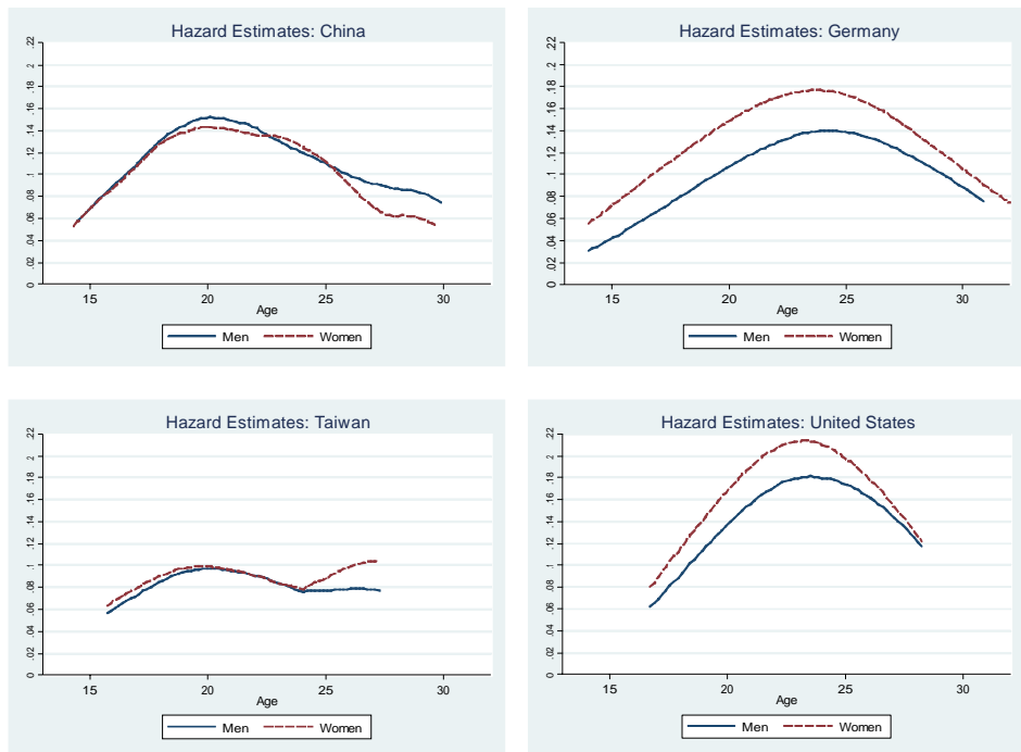
Figure 2: Hazard rates of leaving the parental home for sons and daughters

Comparing the results of survival analyses (not shown) with the cross-sectional distributions of household constellations (Figure 1) yields an estimation of subsequent returns to the parental home after having moved out. Up to age 30, 8% of American youth had never moved out, while at age 30 16% were living with parents – the gap representing the 8% who moved out and returned. Young Germans showed the same percentage for those never leaving, but only 11% were living with parents at the age of 30; i.e., return rates were higher in the United States than in Germany. The likelihood of remaining in and returning to the parental home is markedly higher in China and Taiwan. At the age of 30, 40% of the Chinese were living with their parents, most of them with no intermittent home-leaving. As Figure 1 has already revealed, returning behavior is most prominent in Taiwan, where only 11% of the sample never left their parents and 57% were living with at least one parent in the same household at the age of 30.